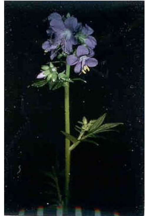
Jacob's-ladder ( Polemonium vanbruntiae )