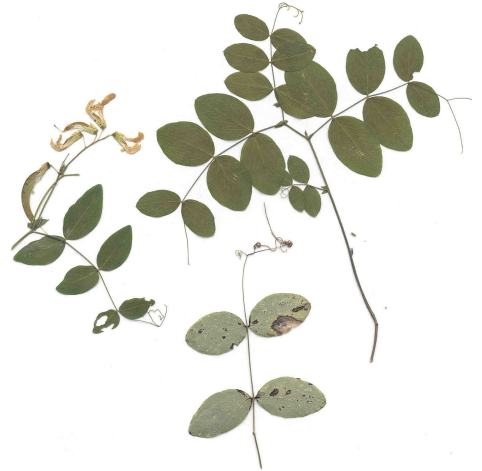
Wild-pea ( Lathyrus ochroleucus )

The wild pea is widely distributed in the more northern and cooler portions of North America. It occurs in the northern or mountain counties in Pennsylvania.